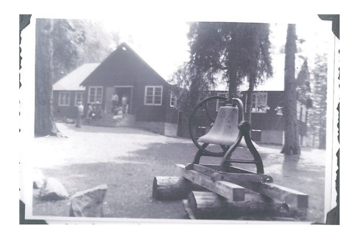
PHOTO: The old bell at Suttle Lake Camp, some time in the 1950s. The bell is still used today.

In 1968, The Methodist Church and the Evangelical United Brethren Church merged to form The United Methodist Church. At almost the same time, the Oregon and Idaho conferences merged in 1969 to become the Oregon-Idaho Annual Conference of The United Methodist Church. The new conference now had stewardship over eight sites: Magruder, Leewood, Suttle Lake, Loon Lake, Latgawa (though it was known by a different name then), Wallowa Lake, Sawtooth, and McCall.